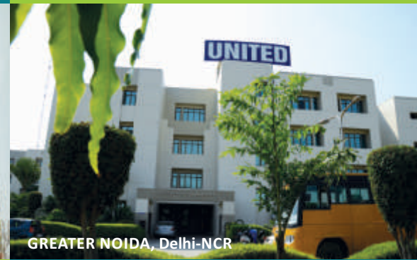
GREATER NOIDA, Delhi-NCR

UNITED INSTITUTE OF TECHNOLOGY Approved by AICTE & Affiliated to APJAKTU, Lucknow