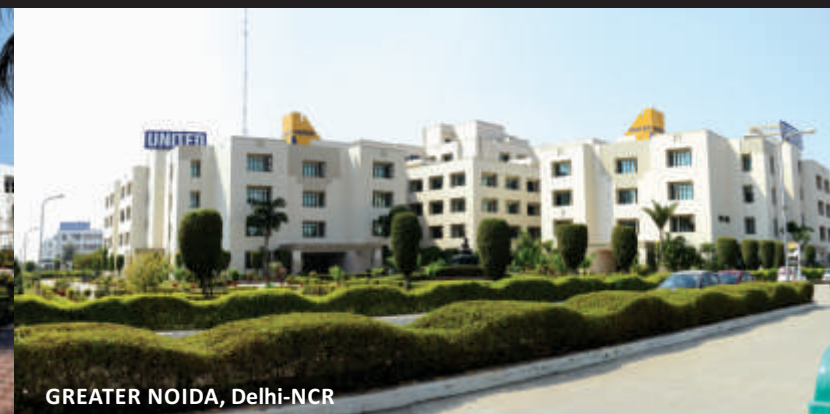
GREATER NOIDA, Delhi-NCR

UNITED COLLEGE OF ENGINEERING & RESEARCH Approved by AICTE & Affiliated to APJAKTU, Lucknow